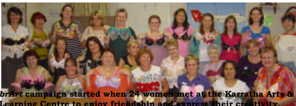
brArt campaign started when 24 women met at the Karratha Arts & Learning Centre to enjoy friendship and express their creativity.