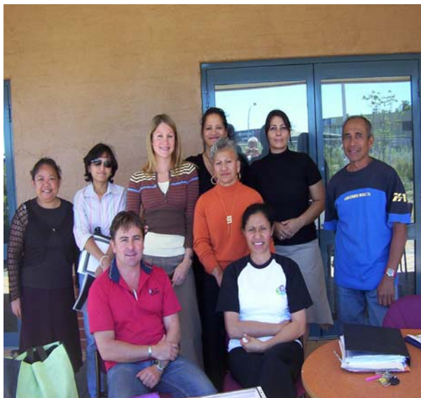
Members of the Pilbara Multicultural Association

Still full of excitement following a hugely successful Multicultural Celebration in June, migrants in Karratha are keen to establish themselves as an official group so that more events like this can happen in the future.