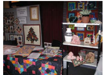
KALC's display at the Lifestyle Expo on 30 th July